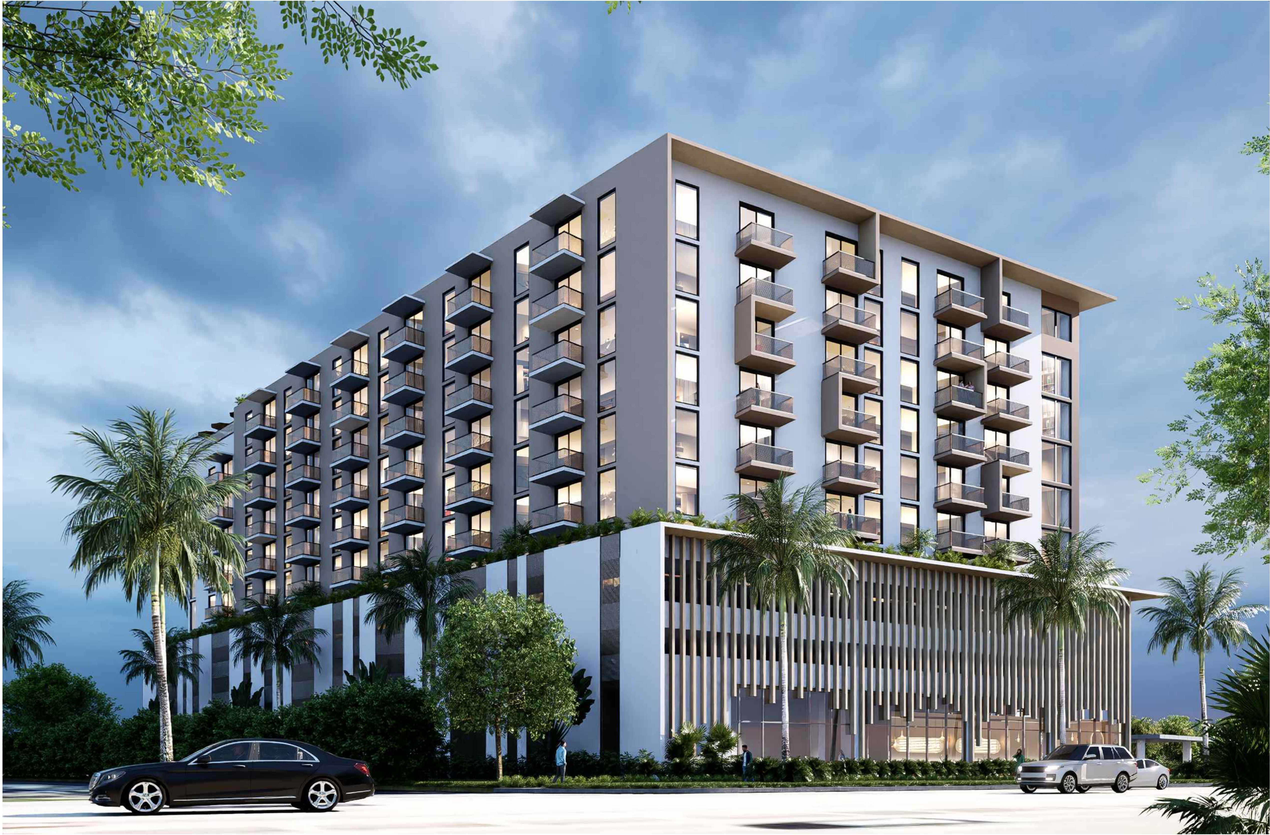
STREET VIEW OF THE SOUTH WEST CORNER OF THE BUILDING